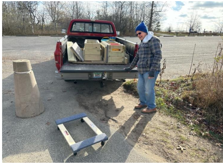
Benches being delivered