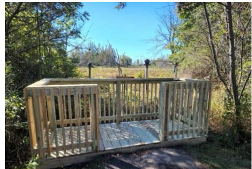
New platform before bench installation.

Michigan Department of Natural Resources (MDNR) replaced the viewing area as part of park upgrades and to support this project. While the new viewing area is a bit smaller than the last one, it was sturdily built. The new platform has a lower entrance platform, so it is more wheelchair accessible. MDNR's contribution was in-kind and in support of this project.