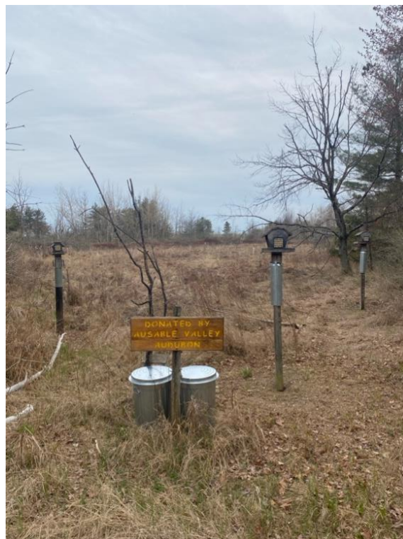
Old Feeders and food storage