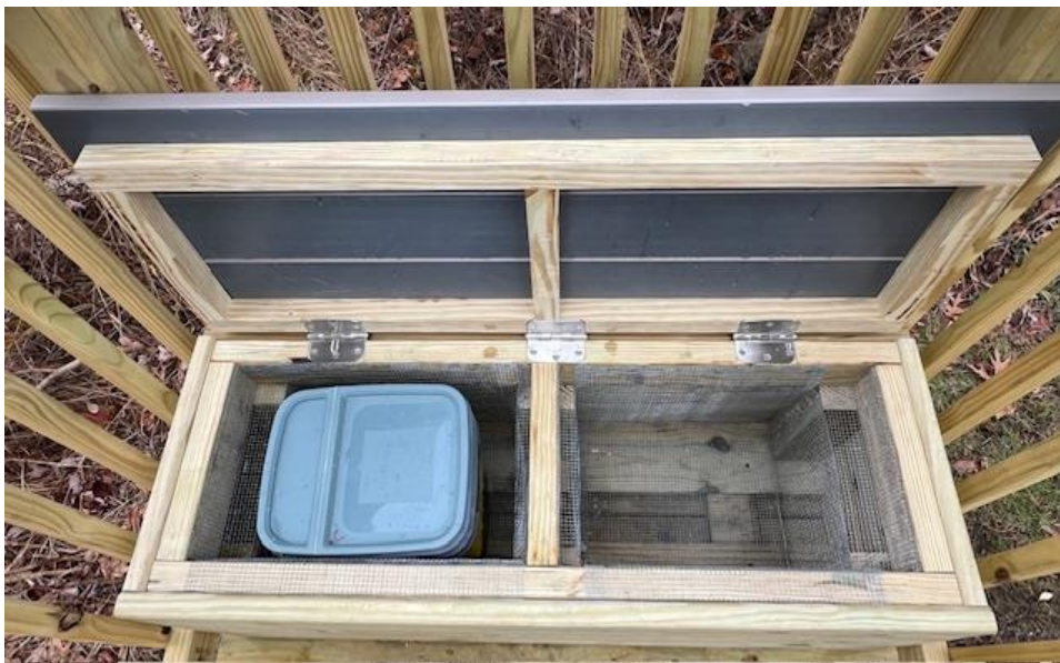
Finished food storage bench, inside

Grant Money Used: $401.86 for bench building materials