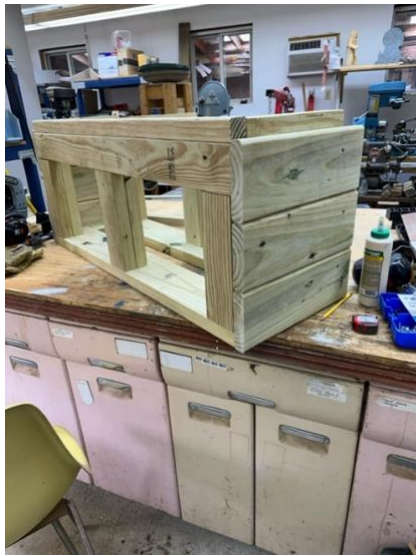
Bench being built

AVA Volunteers built new bird-food storage benches for the new viewing platform. Under the leadership of Bob Kemnitz, they formed a team and brainstormed design elements to address storage that would deter wildlife night raids of the food. Bob and Larry VanWagoner built the food storage benches in Larry's workshop in accordance with the team's design. Each bench (two total) has hardware cloth lined storage space for 50 pounds of seed, PVC plastic seating material, stainless steel hinges, 5/4' cladding, and is made entirely of weather resistant treated wood. Other team members, Tim Morand and Ken Kuck, helped install the benches in the new viewing platform.