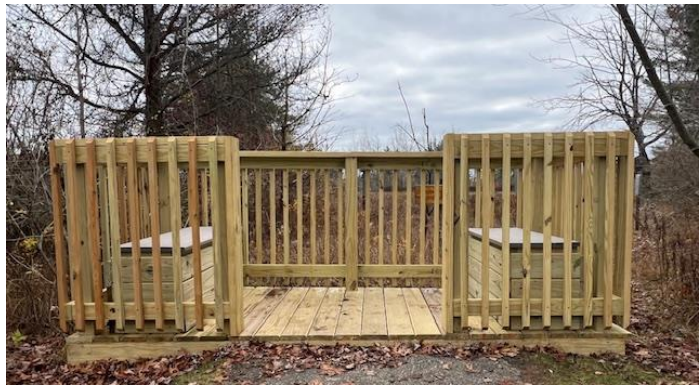
New platform and storage benches.

Michigan Department of Natural Resources (MDNR) replaced the viewing area as part of park upgrades and to support this project. While the new viewing area is a bit smaller than the last one, it was sturdily built. The new platform has a lower entrance platform, so it is more wheelchair accessible. MDNR's contribution was in-kind and in support of this project.