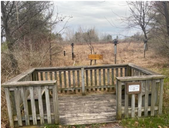
Old Platform and sitting benches,

Tawas Point State Park has a bird feeding station that was donated by AuSable Valley Audubon (AVA) to foster education about bird migration and emphasize protection of this unique and important habitat. The feeding station historically provides a focal point for people to sit and watch birds immediately adjacent to the parking lot, providing access to those that can't walk the non-motorized trails. This project funded updates to the bird feeding station and provides a demonstration area that highlights bird feeding practices that protect feeder birds.