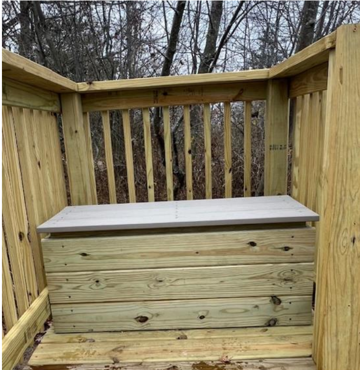
Finished food storage bench, outside